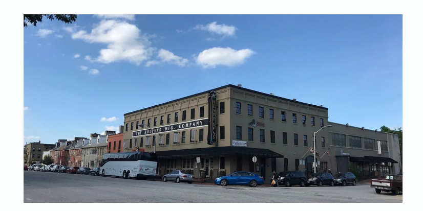
Application of the law