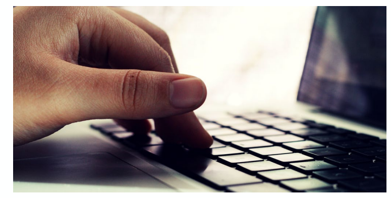
This Photo by Unknown Author is licensed under CC BY Online Research